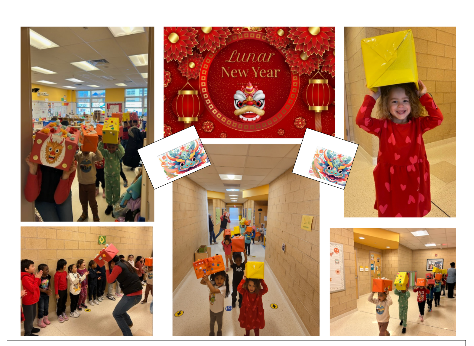
Our PreK celebrating Lunar New Year with our Dragon Parade around the school.